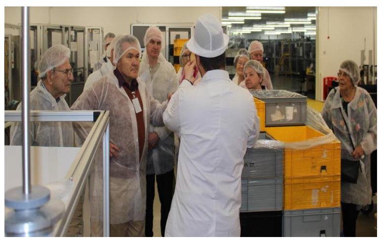
Some of The Pelican Team